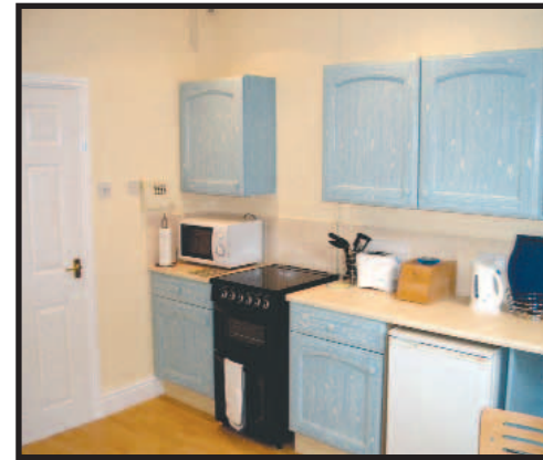
Kitchen / Dining area

For bookings of 7 nights or longer, we offer a 'welcome pack' of local produce, which includes butter, fresh-baked bread, milk, sausages/bacon and other tasty items (subject to availability).