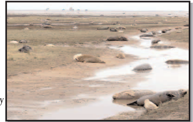
Seals at Donna Nook

For further information or to make a reservation, contact Geoff or Julia Mullett. Telephone: 01507-354464 or 07816-543538. Email: info@Louth-HolidayHome.co.uk or visit our web site www.Louth-HolidayHome.co.uk where events around Louth are listed and an availability calendar can be checked. You can also book or make enquiries online.